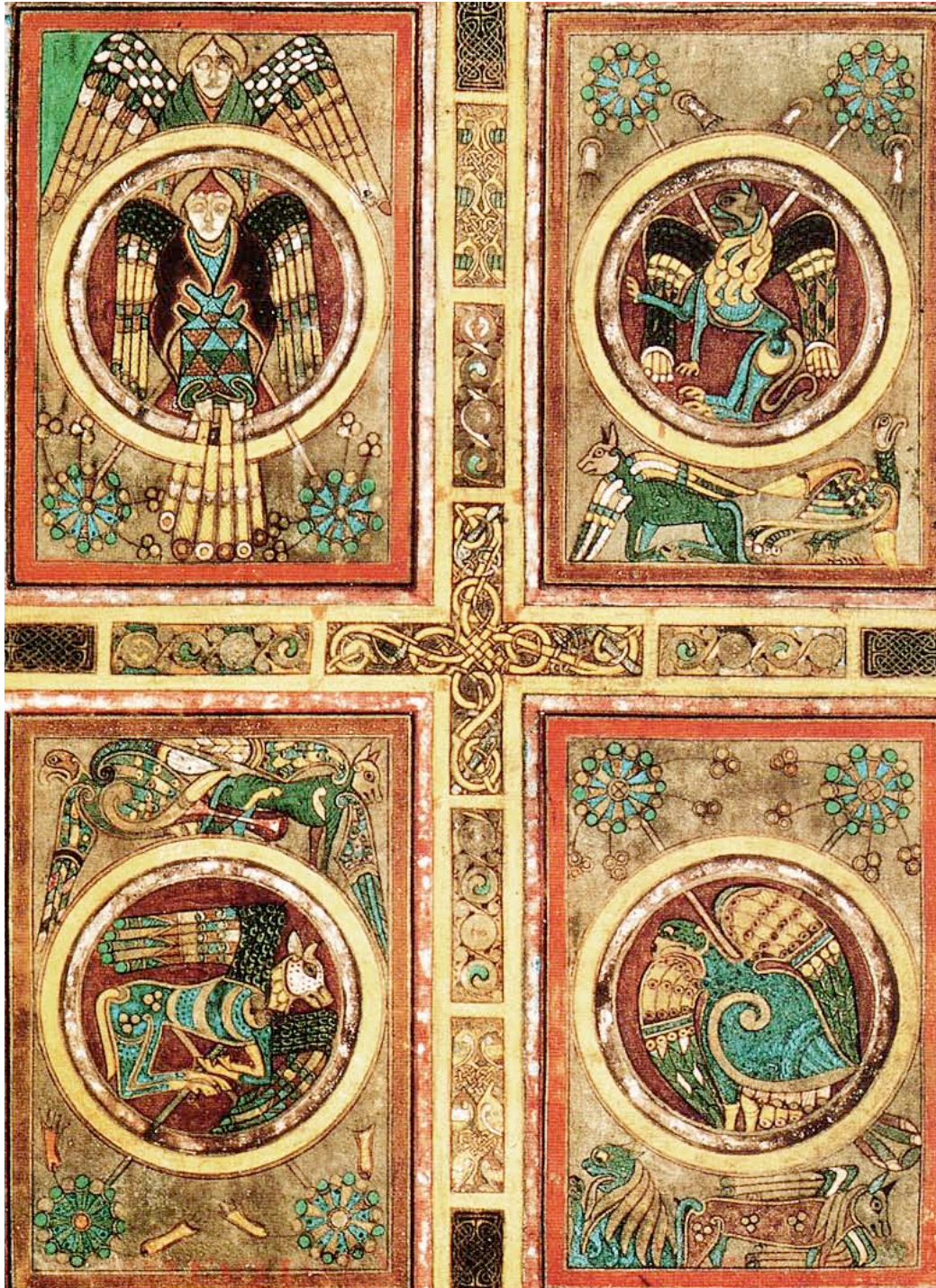
Book of Kells - Symbols of the Four Evangelists (Folio 129)