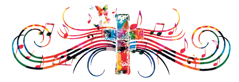
Light the candle - Christ is with us.