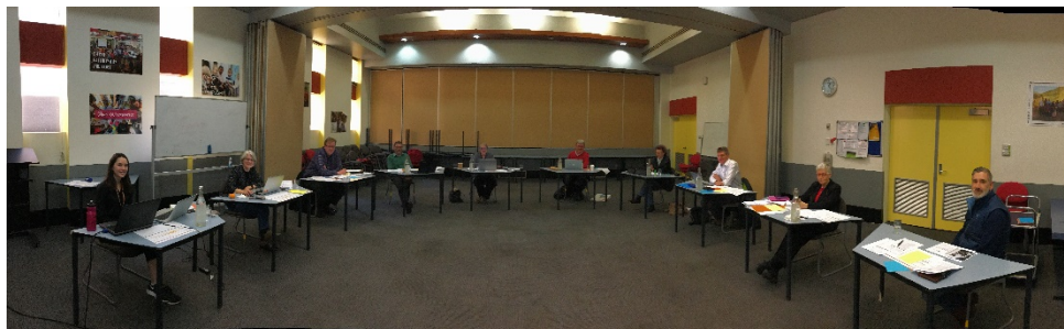
June 29, 2020: the final meeting held in the G1 & G2 rooms at 130 Little Collins St.

So farewell old friend. We will miss you, but are thankful for the life and mission that was fostered from within your walls.