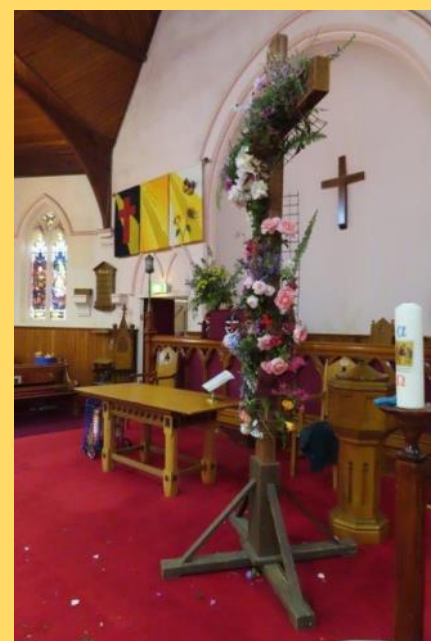
Photo Right: The flower bedecked cross at the front of Castlemaine Uniting Church.

Earlier, people placed flowers they had brought onto an empty wooden cross that was lifted up at the front of the church.