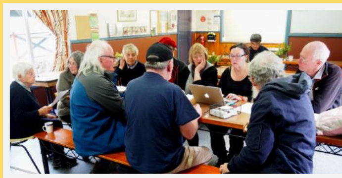
Preparing a submission.